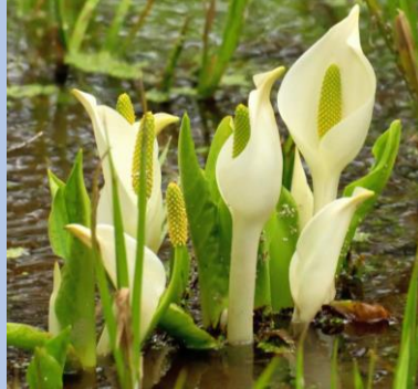
Asian skunk cabbage