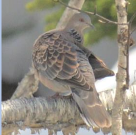
Eastern turtle dove