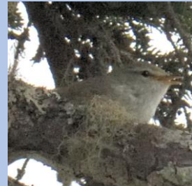
JP Bush Warbler