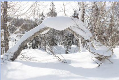
←Tunnel of Erman's Birch

Soon it will be February. In late January, I took a walk around the center with snowshoes. I could see beautiful sceneries here and there with just one step into nature.