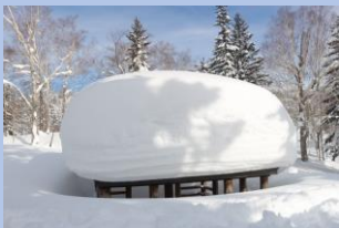
a huge Yukimi Daifuku (Japanese ice cream name)

We recommend snow shoes for who want to take a leisurely stroll.