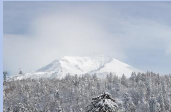
Clear view of Asahidake