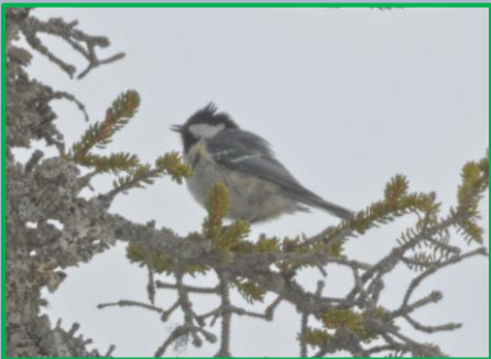
Coal tit Smaller than a sparrow, live in the group. In autumn, they can be seen in Sugatami-pond area.