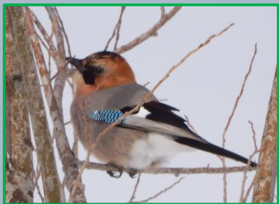
Eurasian Jay Subspecies of jays found in Hokkaido. Jays live in Honshu. They can imitate various sounds