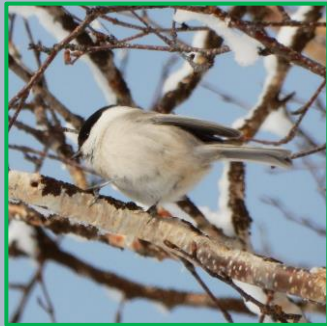
Willow tit difficult to distinguish them from Marsh tit