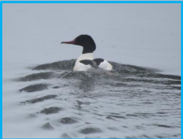
Goosander Rare in the Asahidake area. The picture is a male with a brown head and a shaggy back.