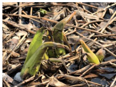
Bud of Asian skunk cabbage