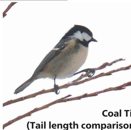
Coal Tit (Tail length comparison)

The Long-tailed Tit in the photo is a subspecies found only in Hokkaido, and can be seen in the Asahidake Onsen area. In Japanese, it is called "shima-enaga." Its tail is quite long in comparison to other small birds.