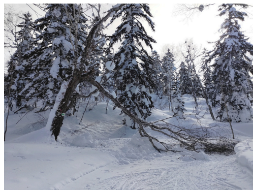
A tree broken by the weight of snow.

The weight of this snow can even break trees, so please watch out overhead.