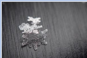
Snowflakes falling on Asahidake Large, well-shaped crystals that could be seen with the unaided eye

We could watch powder snow from Asahidake hot spring area from mid-December, it raised our expectation to the snow of mountains. But as of 23rd December (Wednesday), before the course opened, the bush was still conspicuous on the side of the course, it was not a result we expected. Hopefully this season had just begun, what kind of winter is waiting for us this year?