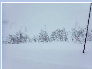
B course side Bush was still conspicuous