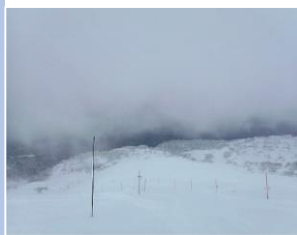
Ski course Open view from Sugatami Station.

※This photographs were taken at Asahidake before course open (23rd December)