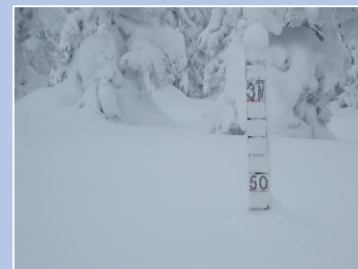
23rd December,2020 snow depth about 2.4m

In February of this year, fine weather continued, the snow depth is not so deep even during in the middle of winter.