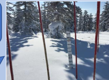
5th February,2020 snow depth about 2.2m

It's hard to see because snow measurement was covered with snow. Snow depth was about 2.5m.