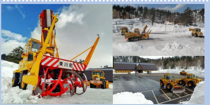
* Public parking lot had become wider

Snow removal operation had carried out during 3 days from March 24th to 26th at the public parking lot in front of Asahidake Visitor center. In the mid-winter, available parking lot space was just ¼ of space due to snow. By snow removal operation, the parking lot came back to its original size.