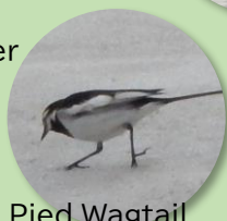
Japanese Pied Wagtail (Visit at Asahidake Onsen in spring)