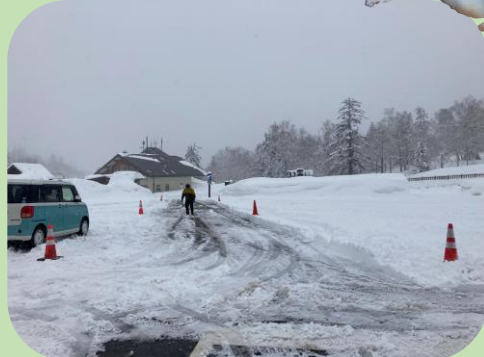
↑ Status of public parking lot in front of VC on May 1st.

* Digital display(AR monitor)& VR goggles