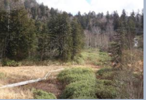
← Status of Sugatami station ~ Sanroku station in Nov 6th