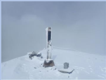
↑ The peak of Asahidake in Oct 7th

The average date of first snowcap in Asahidake is September 25th, but in this year, it was observed late. In mid-October, a lot of snow fell in the hot spring town, It became suddenly a winter scene.