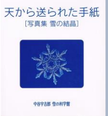
『TenkaranoTegami』 /Ukichiro Nakaya

This book explains the formation of snow crystals in various forms based on the knowledge gained through research by physicist Ukichiro Nakaya, who was fascinated by snow crystals and succeeded in making first production of artificial snow crystals in the world. You can read this book in the visitor center.