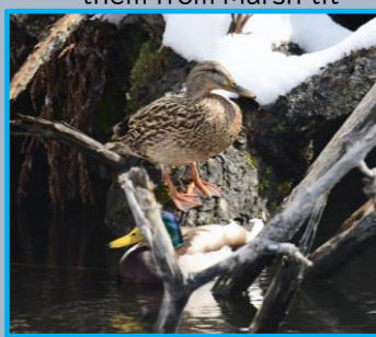
Mallard duck Female(top) male(bottom) Seen in swamps at ski course in mid winter.