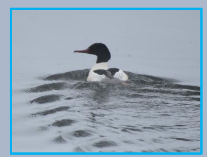
Goosander Rare in the Asahidake area. The picture is a male with a brown head and a shaggy back.