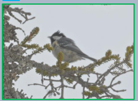
Coal tit Smaller than a sparrow, live in the group. In autumn, they can be seen in Sugatami-pond area.