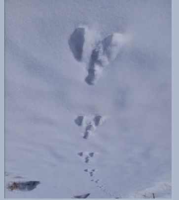
Answer: Mountain hare hippity(front paw)hoppity(hind paws) Y-shaped footprints are

Spring is coming! Animal footprints were signs that spring is approaching, these have been watched on the snow near the ropeway station and mountain through the windows of the ropeway. Whose footprints are these?