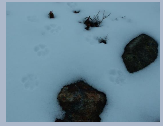
Answer: Ezo red fox Front paw lifts to walk forward, the back paw presses into the front paws track like picture. Footprints are left behind in a straight line.