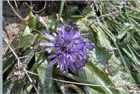
[Heloniopsis orientalis] Liliales A perennial that grows 10~30 cm tall in lowland and peat land. Its leaves are elongated spatula-shaped and flowers are beautiful pale red or pale purple, turn to green with time.