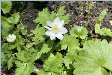
[Anemone flaccida] Ranunculaceae A perennial that grows 15~25 cm tall with hairy stems. It is one of the representative flowers of spring mountain.

At Tenninkyo hotspring, flowers begin to bloom a little faster than Asahidake area. Anemone flaccida resembles a strawberry flower, and Heloniopsis orientalis with purple flowers and large leaves, it has a presence. Besides, Communities of Corydalis fumariifolia can be seen. You can also see communities of Asian skunk cabbage at marshlands on the road toward Tenninkyo hotspring.