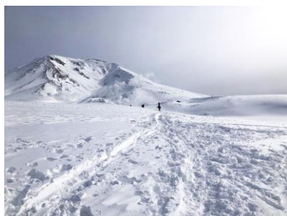
From in front of Sugatami station in March.(elevation: 1600m)