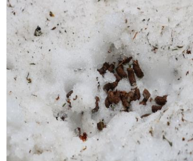
【Hazel Grouse droppings】