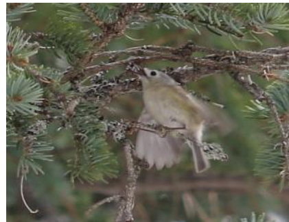
【 Goldcrest 】