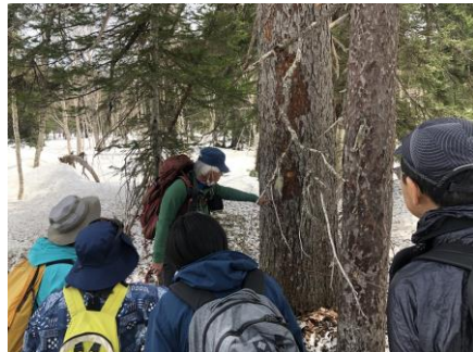
【 Peck marks of black woodpecker or great spotted woodpecker 】