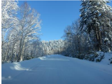
11/16 Near the Asahidake Onsen