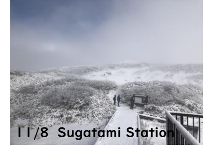
11/8 Sugatami Station

In Asahidake and Asahidake Onsen town, the coloring of autumn leaves was delayed by 10 days to 2 weeks due to high temperatures and heavy rainfall. The first snowfall (10/4) was 9 days later than normal, and the snow plows were in operation at Asahidake Onsen after the snowfall on 10/17, but there was no significant snowfall after that, and the temperature remained high and rain continued. However, there is a possibility of sudden snowfall in Asahidake Onsen town due to cold air, so winter tires and warm clothes (down jackets, knit hats, gloves) are essential for visitors. The Japan Meteorological Agency has indicated that “DOKAYUKI” is increasing in Hokkaido this year due to recent global warming. Please be sure to check the latest weather forecast before you go out.